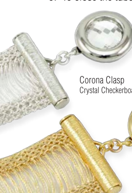
Corona Clasp Crystal Checkerboard