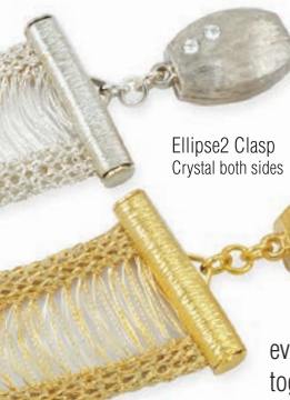
Ellipse2 Clasp Crystal both sides