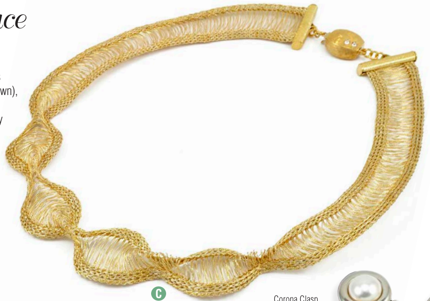
Corona Clasp Crystal Gold Pearl Crystal White Pearl